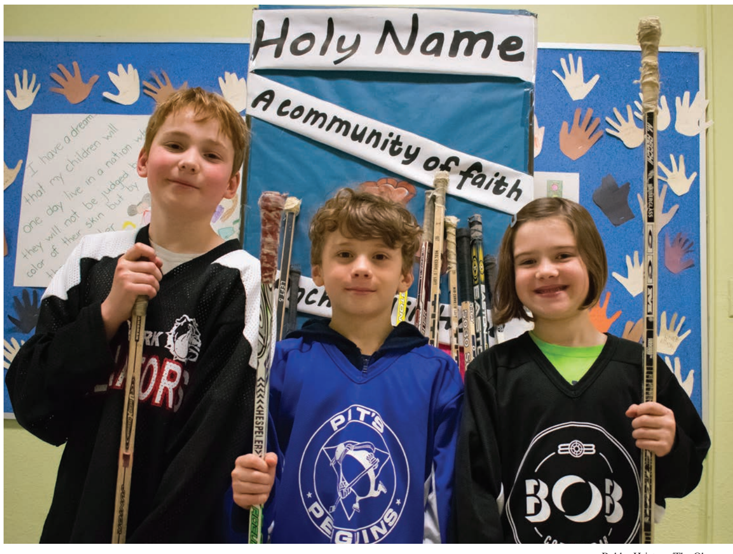
Bobby Hristova/The Observer