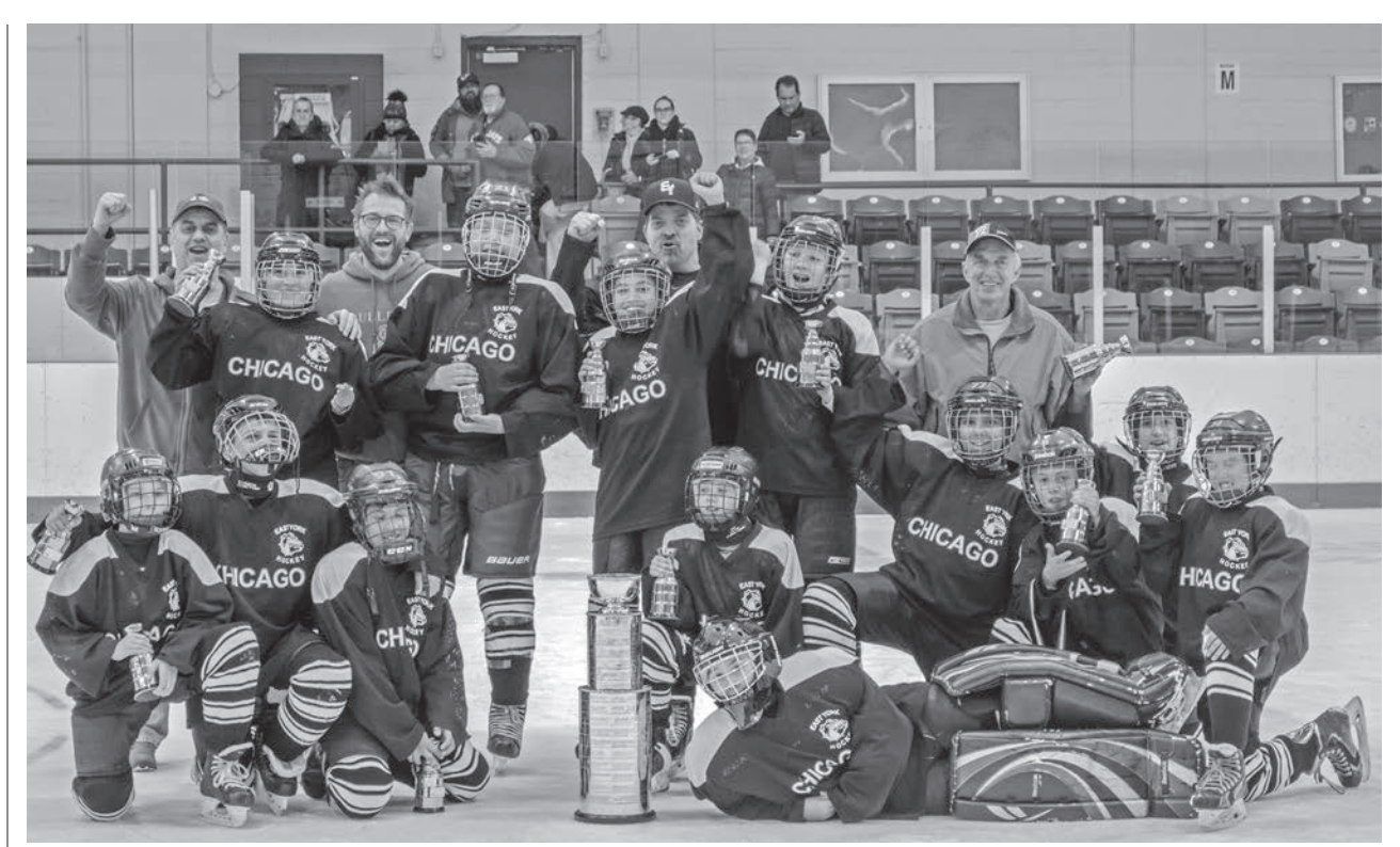
The East York Hockey Association's peewee division, Team Chicago, celebrates an overtime win against Team Boston for the Little Stanley Cup. The event was held April 7 at East York Memorial Arena.

The workshop will run every Sunday (except May 20) at 2:30 p.m. from now through June 24.